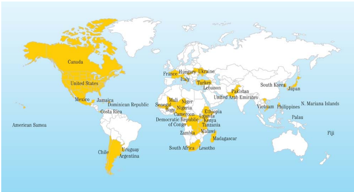
Project WET programs around the world

Since the program's inception in North Dakota in 1984, it has trained over 400,000 educators to use Project WET with students. If we make the assumption that each teacher trained has used the materials with 30 students each year since they were trained, then we can calculate that over the life of the program, more than 40 million students have been reached through Project WET.